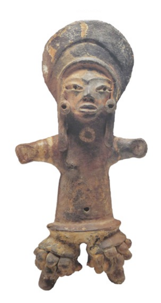
Figure 1: Female figurine with headdress and leg rattles made of clay. Provenance unknown; Middle Preclassic period (950-400 BC).

The Tarascans, who had imported the knowledge of metallurgy from Central and South America (Ecuador and Peru) via maritime routes, developed techniques of bell manufacturing emphasizing specific sound and color properties that