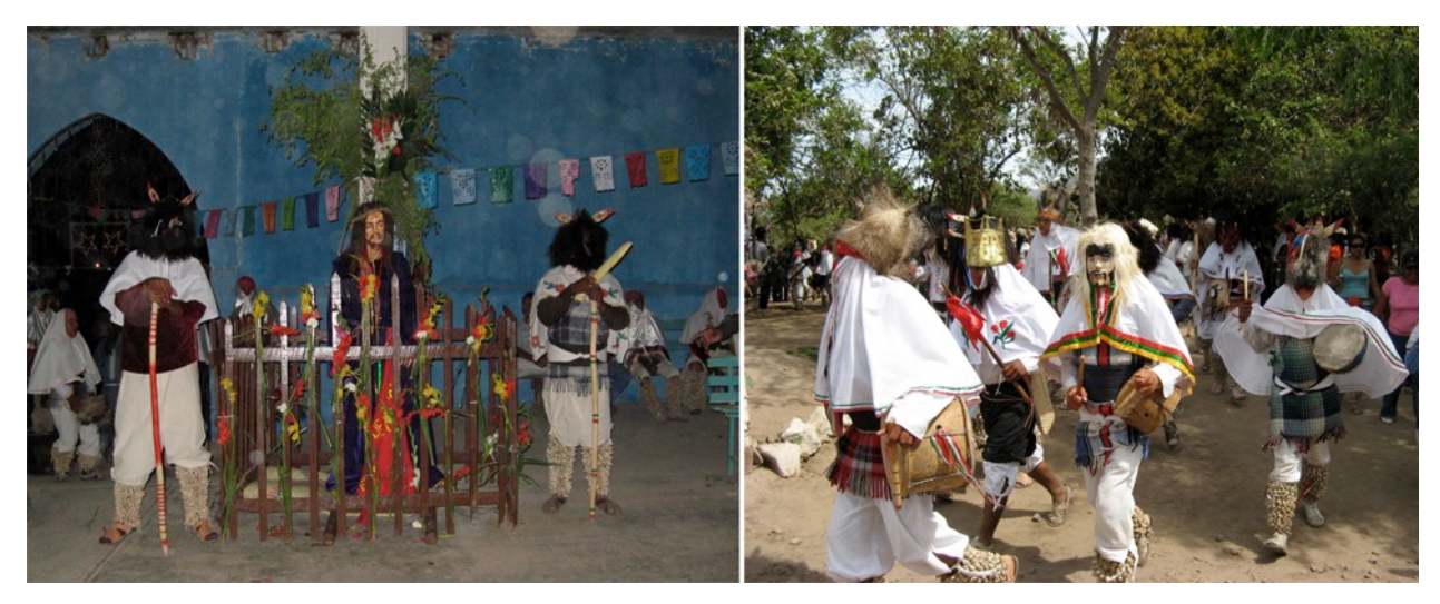
Figure 9: Judíos during Semana Santa in San Miguel Zapotitlán, Sinaloa.