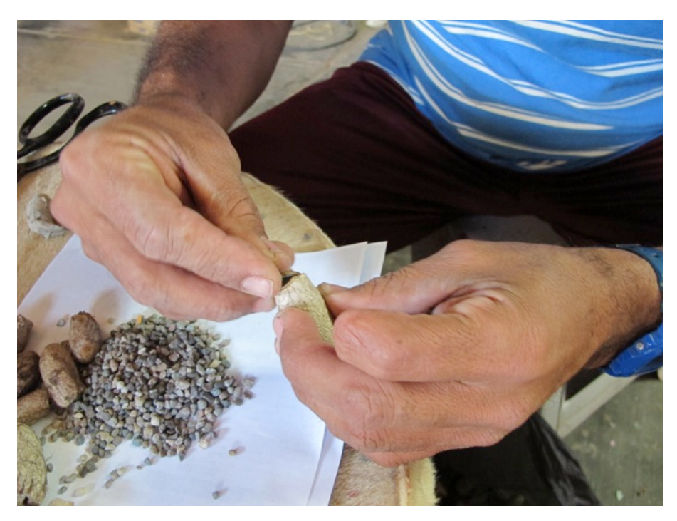
Figure 10: Preparation of the cocoons, "Artesanías El Chester."

The pairs are then sewed together using two cotton strings to interlink the stitches. The beginning loop in the string will be fastened to the dancer's big toe, from which it is wrapped around the lower leg, starting above the anklebone and working upward. Secured with the rest of the cotton strings, the ténabarim will stay put even during vigorous dancing.