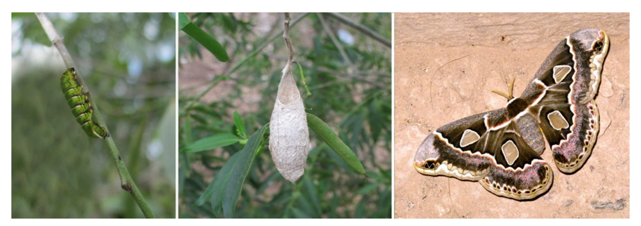
Figure 4: Caterpillar, ténabari, and mariposa cuatro espejos (male).

foothills away from the coastline, the cocoon walls are too leathery to make a pleasing sound, but they last longer. The pupae remain dormant throughout the dry season, their ash-colored cocoons hardly distinguishable from their surroundings. Prolonged droughts may make them stay inside their chambers for several years. Due to human greediness, this stage in the cycle of a moth's life, as will be shown later, has become most vulnerable.