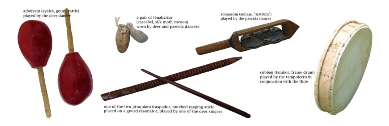
Figure 11: Sound-making instruments based on complementary dualism used in Yoreme ceremonies: gourd rattles, ténabarim, rasp (the second rasp has wider cut notches), a sistrum-like hand rattle, and a frame drum.

within themselves the duality of being and becoming, manifesting themselves as specific phenomenal beings (the sun, moon, animals, etc.), although, in so doing, they do not lose their original nature of constant becoming or intentionality" (Wright 2013: 45). Complementarity becomes the major organizing principle within all aspects of community life, from social to spiritual. Yoreme value qualities of sound without having developed a grand philosophical theory about the nature of music and beauty; thus, indigenous sound aesthetics is not readily available to the outside observer. As mentioned above, Yoreme fill each cocoon forming a pair such that they emit a different, but complementary pitch. Left and right cocoon leg rattles produce different pitches; the two notched rasps, the pairs of metal discs of the wooden hand rattle, the pair of the handheld gourd rattles, and the two membranes of the handheld frame drum all succumb to the principle of this complementary dualism (Fig. 11).