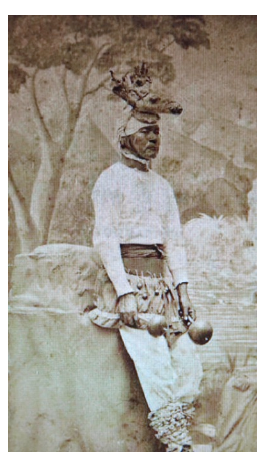
Figure 2: 1870 carte-de-visite. Provenance unknown.

Several more photographs were taken by foreign scientists and travelers in the late nineteenth and early twentieth centuries that show pascola dancers with belts of coyoolim (brass bells) and both pascola and deer dancers wearing leg or ankle rattles made of cocoons.<sup>14</sup> Staged photographs from then on consistently show attires corresponding with contemporary usage by both Yoreme and Yaqui communities in Sinaloa and Sonora.<sup>15</sup>