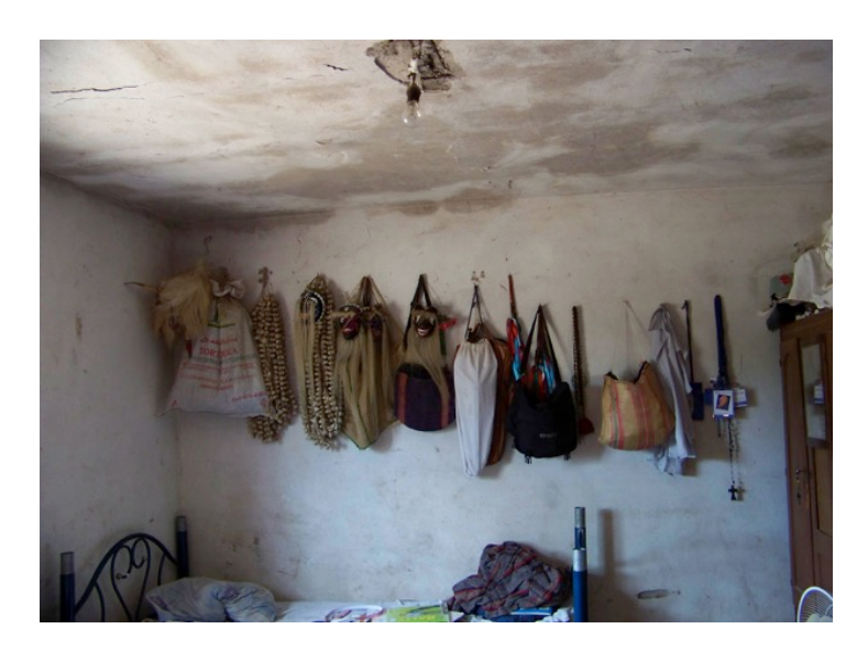
Figure 6 Ceremonial paraphernalia in a Yoreme house.

In November 2014, biologists at the university in Culiacán alerted the public about the impending disappearance of the mariposa cuatro espeios and urged Mexico's environmental ministry to declare the species.<sup>29</sup> insect an endangered Several newspaper reports picked up the story blaming the Yoreme (or collectors that commercialize the cocoons) as culprits, for they use the cocoons in their costumes for the pascola and deer dances.<sup>30</sup> Yoreme feel unjustly accused for the vanishing of the mariposa cuatro espejos, holding that their ancient customs have evolved from a close relationship