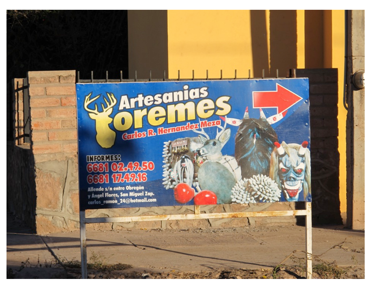
Figure 7: Advertising a mestizo-owned artisan workshop in San Miguel Zapotitlán, Sinaloa.

The artificial desiccation of the alluvial plains for the extraction of irrigation water increased depressions that are at risk of temporary flooding during the rain season. Over the decades, the government relocated many indigenous people from these zones into newly created settlements on higher grounds. Despite the hydroelectric dams up in the Sierra to regulate the rivers' water flow, the floodplains are still prone to occasional inundation. Yoreme keep their ténabarim stored away in a plastic or cotton bag when not in use: like for other things in their humble dwellings, a nail will do to keep them off the ground and dry (Fig. 6). Apart from possible damage by water, the use of the leg rattles during the rituals also wears them off. For instance, one of the movements pascola dancers may do to create a harsh rattling sound is to hit their lower legs together, squashing the tender cocoons; or dancers may accidentally step on the ténabarim and crush them if the string comes loose during the dance. If taken good care of, however, ténabarim can last a lifetime despite the delicate material. The need to manufacture a new pair of leg rattles for one's own use is usually of economic nature. As already mentioned, when performing at a fiesta (ceremony) outside their community, dancers may be enticed to sell their ténabarim for dearly needed cash. However, few Yoreme make leg rattles with a commercial intention.