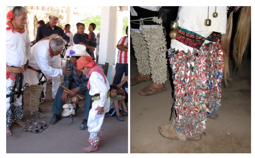
Figure 14: Leg rattles of insect- and man-made materials: plastic water hose and aluminum can. The boy deer wears a belt with squeezed beer bottle caps instead of hooves to practice the dance.

Deer and pascola dancers, musicians, and singers are, by tradition, bestowed with the responsibility to transmit their deep knowledge by way of sound and movement and so to convey the meaning of Yoreme humanity. Unlike in Yoreme culture, among the Tarahumara the deer has lost its symbolic significance: Deer hooves on the belts have been replaced with shell casings or tubes of tin foil, yet, according to Bonfiglioli (2006: 89), they retain their original connection to the hunt. For lack of deer hooves, some Yoreme deer dancers have substituted them with pig hooves, which are practically indistinguishable in shape as well as in sound — both aspects important to Yoreme deer dancers. The shortage of cocoons has forced dancers to be inventive: some use plastic water hoses or aluminum cans to fabricate their ténabarim (Fig. 14).