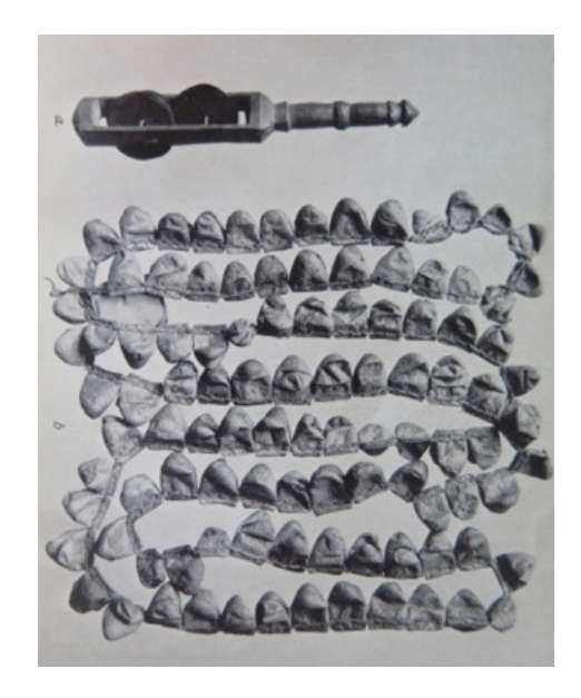
Figure 3: "Yaqui Rattles. a) Used in Deer [sic, pascola] dance; b) worn in Deer dance."Collected by Edward Palmer in 1870 for the Smithsonian Institute (Densmore 1932, Plate 29).

aspect of the deer and pascola dancers, turned to the basic description of "cocoons with gravels inside" (Spicer 1980: 102), "capullos de mariposa con pequeñas piedrecillas por dentro" (butterfly cocoons with little gravels inside, Olmos Aguilera 1998: 113), or "capullos de crisálida" (cocoons of the chrysalis, Ochoa Zazueta 1998: 195). Even more recent descriptions of indigenous dance in northwestern Mexico avoid referring to the specifics of materiality: Shorter (2009), whose monograph centers on the Yaqui deer dance, mentions "leg rattles" once (not even rendering their Yaqui name); the over 400 page heavy Atlas etnográfico of Mexico's northwestern indigenous peoples (2013) includes striking color photographs featuring dancers with ténabarim including the newer versions of man-made materials and an overexposed close-up of a mariposa cuatro espejos; although the Atlas greatly emphasizes material culture and leg rattles are used by several of the indigenous groups discussed, they are merely described as "una sarta de capullos de mariposa con unas piedritas adentro, que produce un sonido muy peculiar" (a string of butterfly cocoons filled with pebbles that produce a very peculiar