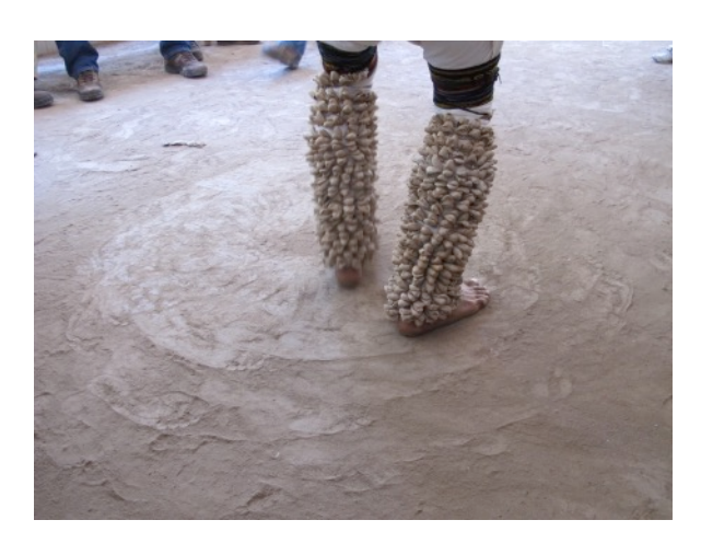
Figure 13: Footprints of dancing pascola.

Spiral motifs are found in a wide variety of representations throughout native cultures. Perceived as an entrance to the spirit world, the counter-clockwise spiral is one of the most common figures reportedly seen during shamanic trancing.<sup>39</sup> Upward–downward and spiral motions are essential in Yoreme performativity. The strings of ténabarim are wrapped around the leg spirally (working clockwise upward, but symbolically suggesting a motion toward the earth); the pascola dancers move counter-clockwise when dancing to the harp–violin music, imprinting a volute of footprints in the dirt (Fig. 13).<sup>40</sup>