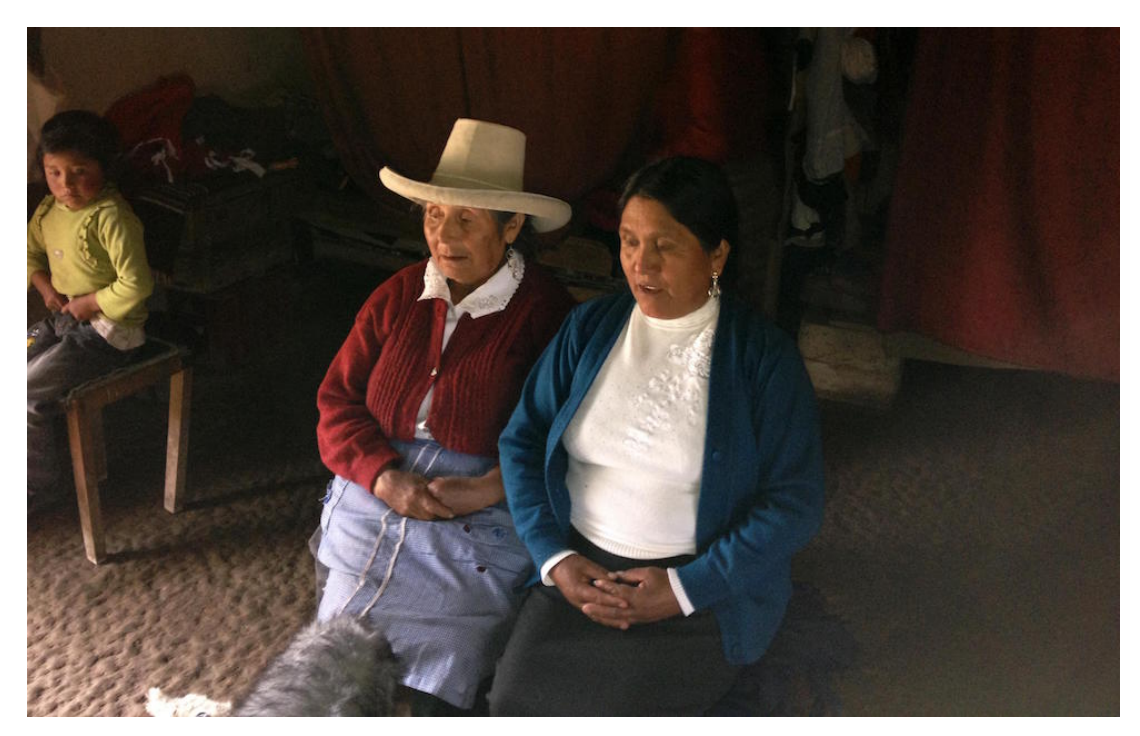
Figure 4: Pechada singers in Apán Alto.

"Las rondas en estos pueblos" (The rondas in our towns)