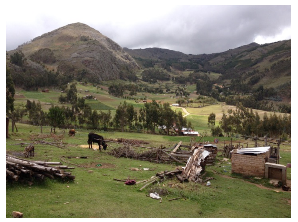
Figure 1: Rural Cajamarca.

implementation of large-scale gold extraction at the end of the twentieth century disrupted the rural identity of Cajamarca, triggering traumatic demographic changes. Mining caused a significant migration flow of national and international professionals, introducing new commodities, reinforcing tourism and non-traditional trade (Steel 2013: 242). But this economic growth is devious. Throughout the last centuries mining had played a decisive role for the disruption of traditional Andean social bonds in other Peruvian territories, imposing capitalistic economic relationships like wage labor and commodification in the region. Groups linked to subsistence economy were integrated into a capitalistic system as food providers for mobilized miners radically transforming their traditional social structures (Assadourian et al. 1980: 35).<sup>3</sup>